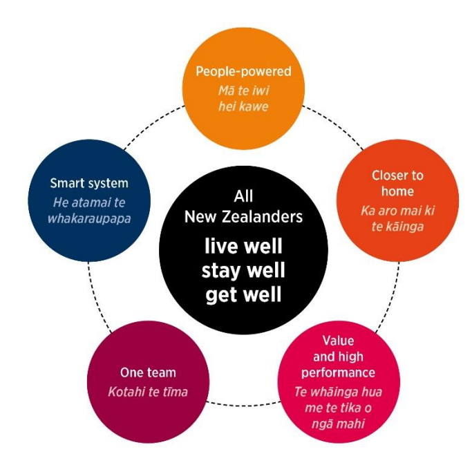
Figure 1: Five strategic themes of the New Zealand Health Strategy

The Roadmap of actions 2016 in the New Zealand Health Strategy identifies the Review as one of its actions.